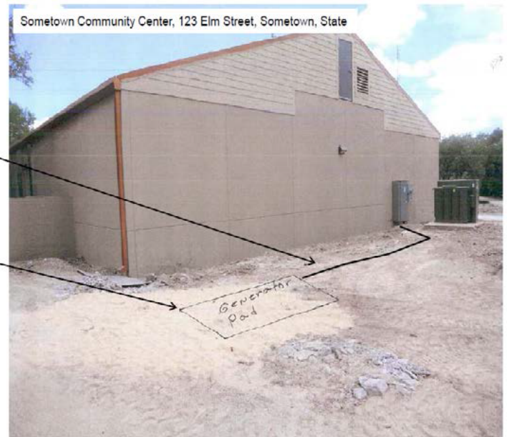
Figure 4. Ground-level photograph showing proposed ground disturbance area.