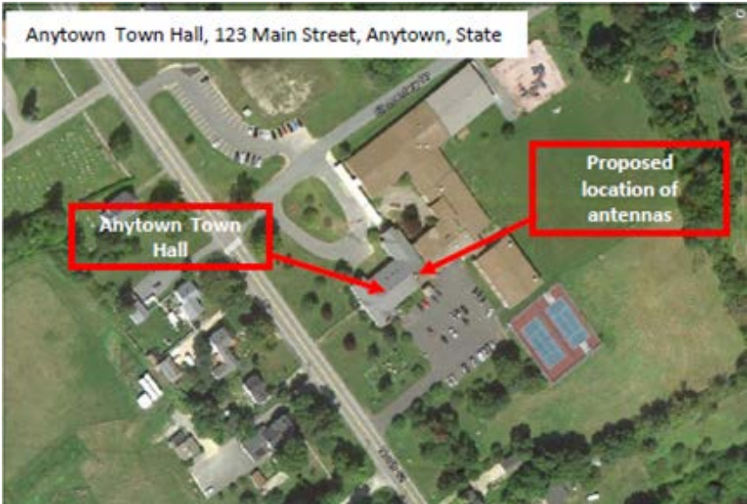
Figure 1. Example of labeled, color aerial photograph.

Aerial Photographs. The example in Figure 1 provides the name of the site, physical address and proposed location for installing new equipment. This example of a labeled aerial photograph provides good context of the surrounding area.