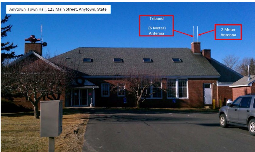
Figure 2. Example of ground-level photograph showing proposed attachment of new equipment.

Ground-level photographs. The ground-level photograph in Figure 2 supplements the aerial photograph in Figure 1, above. Combined, they provide a clear understanding of the scope of the project. This photograph has the name and address of the project site, and uses graphics to illustrate where equipment will be installed.